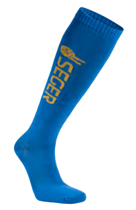
6025057 SPORT COMPRESSION SOCK

Classic Football sleeve. Rib knit cuff. QUALITY: 99% Polyamide, 1% Elastane SIZES: One size